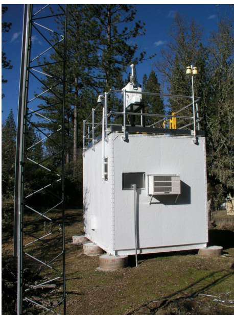
Glenbrook GAMP Station